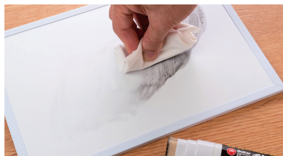
2. Wipe with tissue or cloth.